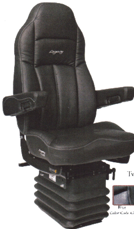
Two Tone UltraLeather Color Options